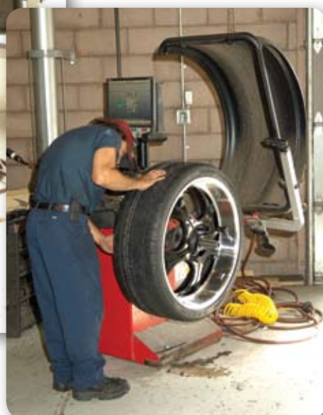
Andy Wurm Tire & Wheel has been in business since 1972, providing a wide range of services from full-service repair to high-end custom wheel and tire packages.

Andy Wurm Tire & Wheel completes 80 to 100 tickets a day and relies on high-quality equipment to do the job right and build their reputation.