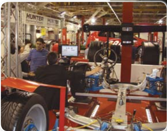
Hunter demonstrates its wheel service equipment in dozens of languages during the five-day show.