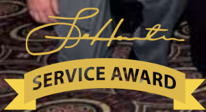
Front row, from left: