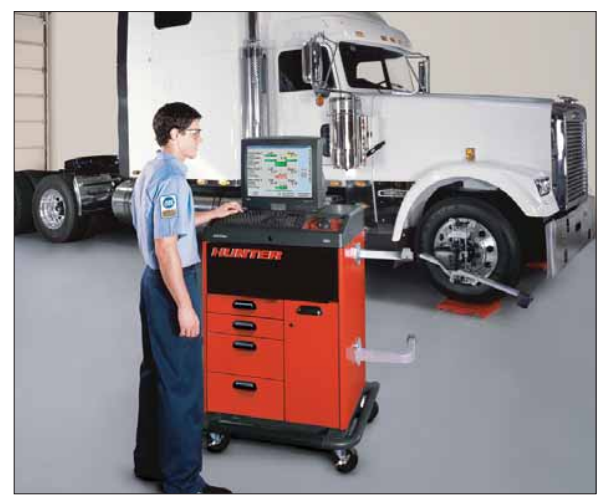
All Hunter Series 811 aligner cabinet configurations and a combination of flatpanel display and standard monitors are available for the 811T-Plus.

unter's premium 811T-Plus alignment system seamlessly interchanges between car and heavy-duty truck service. The system accommodates either electronic sensors or digital camera-based sensors, automatically recognizing the sensor type when switching from car to truck service. Premium productivity and profitability features include multi-media information and instruction for passenger cars and light trucks. Options include Hunter Online Internet-based information and management services for passenger cars or heavyduty trucks and wireless in-shop Internet access capability.