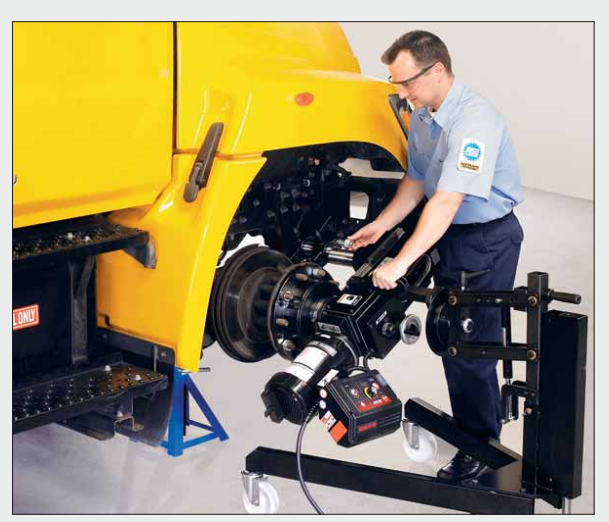
The OCL430MD trolley provides an extended low-to-high working range required for servicing vehicles when a lift rack is not available or practical.