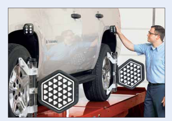
When the Live Ride Height body-mounted targets are installed, measurements are instantly displayed on the aligner screen in a dynamic 3-D model.

This exclusive, patented feature lets technicians use live measurements to <u>adjust</u>, jounce and confirm vehicle ride height in as little as one trip around the vehicle! When used with WinAlign Tuner™ software, it is an ideal tool for modified vehicle service. It also enhances Hunter's patented Suspension Body Dimension Audit feature for checking vehicle alignability.