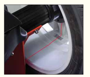
BDC Adhesive Weight Placement Laser

This shop saved 1,939.50 oz. (31.7%) of weight. Fiftythree percent of the wheels were dynamically balanced using only one weight.