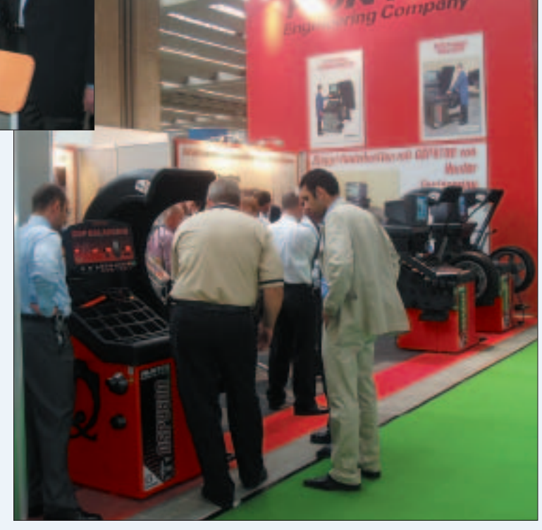
Hunter exhibited a range of new wheel balancer technology at Automechanika, attracting crowds for the duration of the event.

In addition to European industry buyers, the Hunter booth entertained guests from throughout the world. Hunter distributors from 21 European countries were joined by guests from as far away as New Zealand and Argentina.