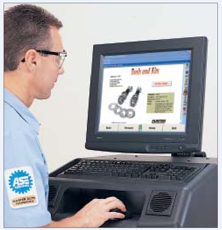
Tools & Kits "Order Now" feature of WinAlign® Software 7.0 lets technicians order parts online from the aligner console.

unter has released the newest version of its award-winning WinAlign® Alignment Software. WinAlign Software version 7.0 adds new capabilities and supports more available features that speed and simplify wheel alignment and provide quicker and easier access to information.