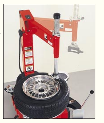
The TC3000 conventional swing-arm tire changer is designed for speed, maximum durability and ease of use.