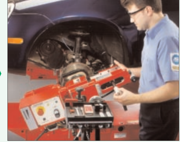
Cut depth is adjusted and the rotor is machined completing the job in as little as 10-minutes.

A Hunter upgrade kit is now available that adds fully automatic compensation to OCL360 on-car brake lathe models not already equipped with this timesaving feature. Shops that use the 1-hp OCL360 model can now take