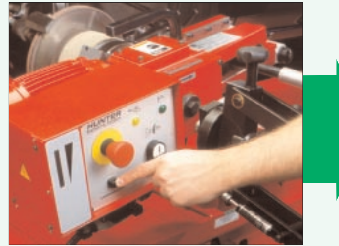
After setting up the job the technician simply presses a button to automatically compensate for lateral runout.

A Hunter upgrade kit is now available that adds fully automatic compensation to OCL360 on-car brake lathe models not already equipped with this timesaving feature. Shops that use the 1-hp OCL360 model can now take