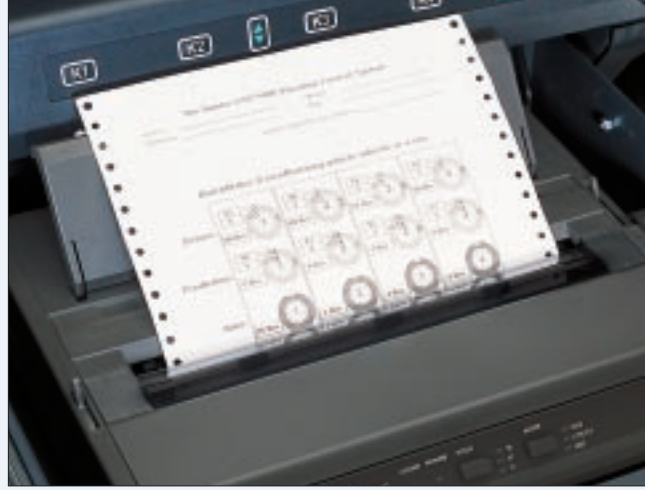
Printouts of Road Force Measurement<sup>®</sup> results explain needed service and help gain more repair authorizations.

The GSP9700's Road Force Measurement® System simulates a road test to identify radial force variation and solves wheel vibration problems before the customer leaves the shop.