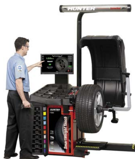
The intuitive touch screen interface quickly trains new technicians.

The SmartWeight Touch also uses Hunter's patented eCal™ auto-calibration to electronically and automatically calibrate the balancer without any input from the operator, making it a truly "self-calibrating" balancer. As with any Hunter premium wheel balancer, the SmartWeight Touch uses patented SmartWeight® technology, which improves balance and minimizes weight usage.