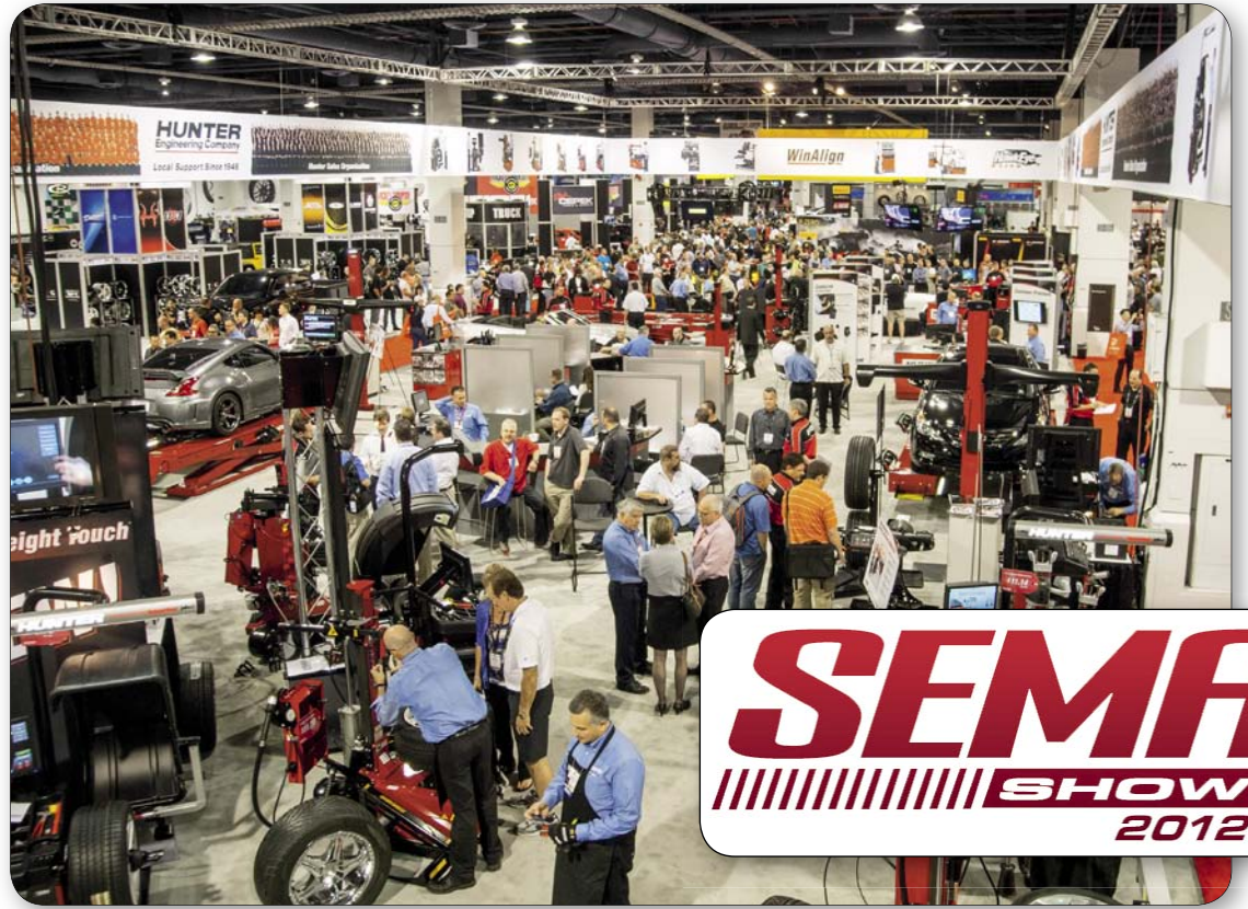
Hunter's booth buzzed with activity at SEMA 2012. Quick Check inspection system demos and Road Force Touch speed demos took place every fifteen minutes.

SEMA is the premier automotive specialty products trade event in North America. This year, more than 2,200 exhibitors in 35 categories attended the show, drawing 60,000 domestic and international buyers. This year marks Hunter's sixteenth year attending the show.