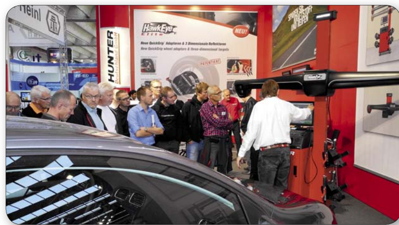
A group of German customers watch an Alignment Quick Check demonstration.