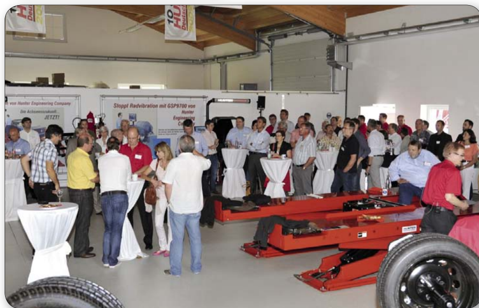
Hunter Deutschland staff and customers celebrate the facility's tenth anniversary in the training center.