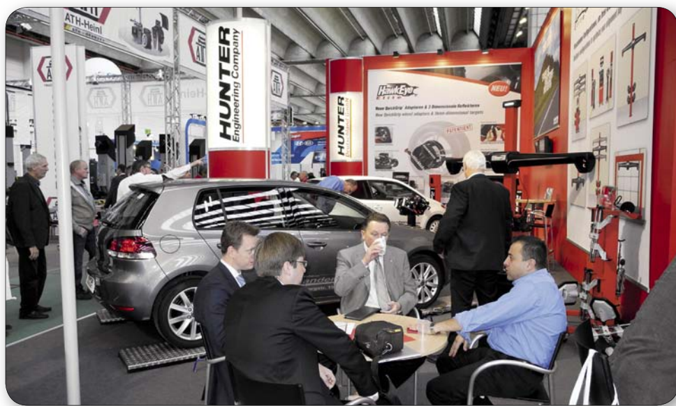
Hunter's booth featured Road Force Touch balancers and Alignment Quick Check systems.

The revolutionary balancer performs a simulated road test using Hunter's patented load roller to find hidden vibration problems and offers match-mounting instructions to minimize forces. The Road Force Touch also features a new intuitive touch screen interface and patented eCal™ true auto-calibration.