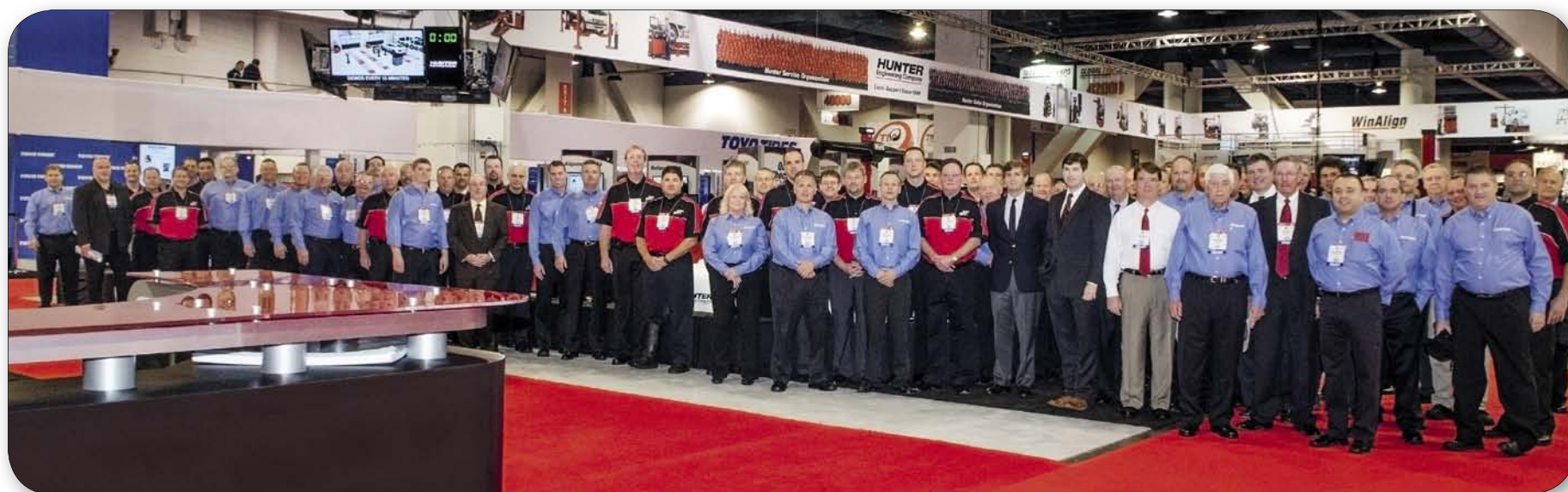
Nearly 100 Hunter employees and representatives managed Hunter's booth at SEMA this year.