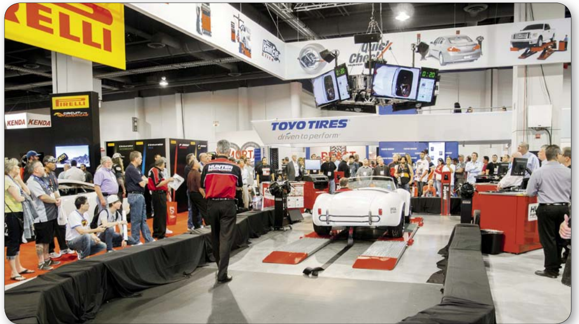
Spectators witness a demonstration of new Hunter Quick Check, the fastest inspection system in the industry.