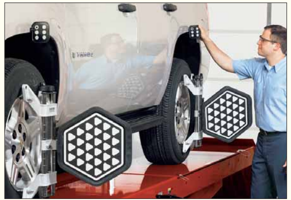
The Live Ride Height Measurement Kit option includes four body-mounted targets. When installed, the measurements are instantly displayed on the aligner screen in a dynamic 3-D model.