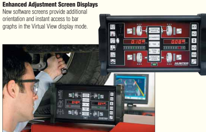
The Cordless Icon Remote Indicator, at bottom, and the Cordless "Plus" Remote Indicator function as a remote control from anywhere underneath or around the vehicle.

Technicians can maintain complete control and unencumbered cordless communication when making adjustments underneath the vehicle. A "Plus" model allows the transmission of additional vehicle measurements to the aligner.