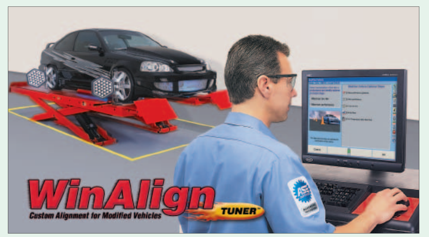
WinAlign Tuner™ custom alignment software for modified vehicles is a standard feature of Hunter Series 811 Plus premium alignment systems.

unter's WinAlign Tuner<sup>™</sup> custom software meets the alignment needs of shops servicing custom, restyled and modified vehicles. It augments Hunter's WinAlign<sup>®</sup> software with procedures and tools to align vehicles for performance or appearance. Technicians can choose performance-oriented alignment or alignment that preserves a high-performance look without sacrificing tire life.