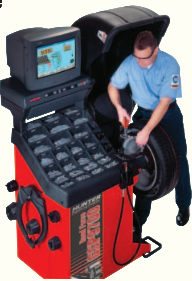
SmartWeight can reduce annual wheel weight costs by 33% or more and can also reduce the time it takes to balance most wheels.

SmartWeight technology is available on all Hunter GSP-series wheel balancers. More detailed information can be found at www.weightsaver.com .