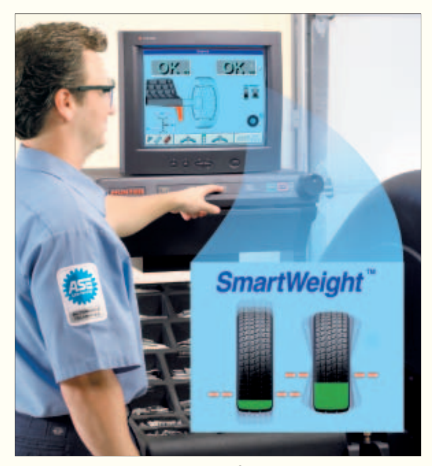
To achieve the best possible balance, SmartWeight balancing technology evaluates actual static and couple forces independently and applies an appropriate tolerance to each.

unter's patented SmartWeight™ balancing technology is a revolutionary wheel balancing method that minimizes correction weight use and maximizes productivity, saving shops money on both material and labor costs.