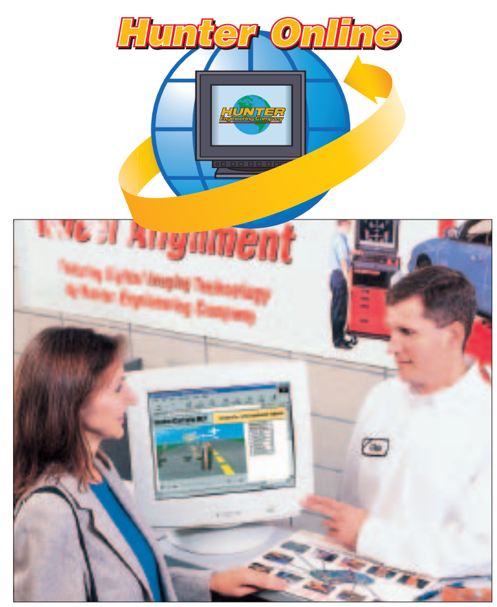
The Hunter Online suite of online tools includes WebSpecs.NET, ShopResults.NET and UnderCarInfo.NET. These features harness the power of the Internet to boost shop productivity and customer satisfaction.