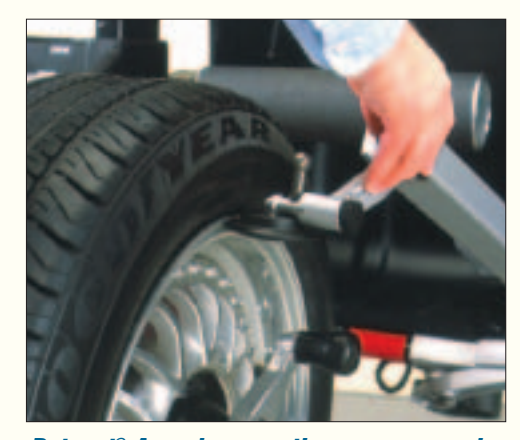
Dataset® Arms improve the accuracy and speed of data entry and weight placement, and measure lateral and radial rim runout.

unter has introduced a series of mid-range CRT interface wheel balancers. The CRT interface provides helpful graphic displays to make advanced balancing procedures faster and easier, especially when servicing vehicles with custom wheels, low-profile tires and design features that affect vibration sensitivity.