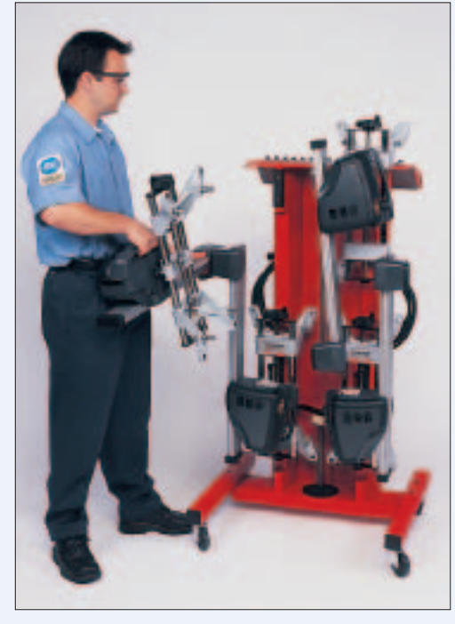
The cart stores either DSP600 targets or DSP500 sensors and wheel adaptors.