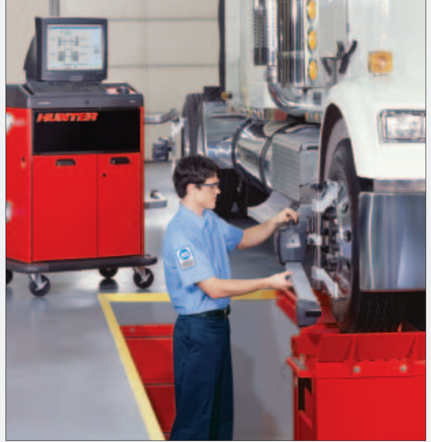
DSP506T Sensors are shown above with standard wheel adaptors. An optional hub center adaptor is available for specialty and hard-to-mount wheels. Hunter offers a complete line of heavy-duty service products including alignment systems, racks and tire changers.

DSP506T Sensors are matched with Hunter's Series 811T console for fast, easy alignment service. The 811T combines exclusive Hunter WinAlign®HD software and a Microsoft® Windows®XP operating system to deliver high-performance alignment capability for heavy-duty truck, trailer and bus applications.